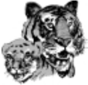
Tiger Cubs BSA